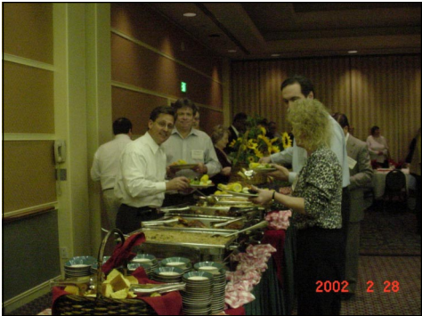
We all enjoyed a great meal prior to trying our luck at the casino.