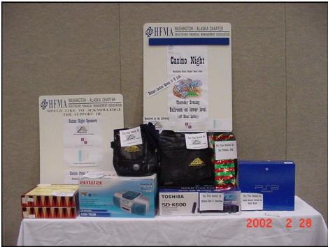
Vendors donated great prizes.