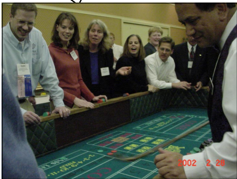
AAHAM and HFMA members enjoy a lively time at the gaming tables.